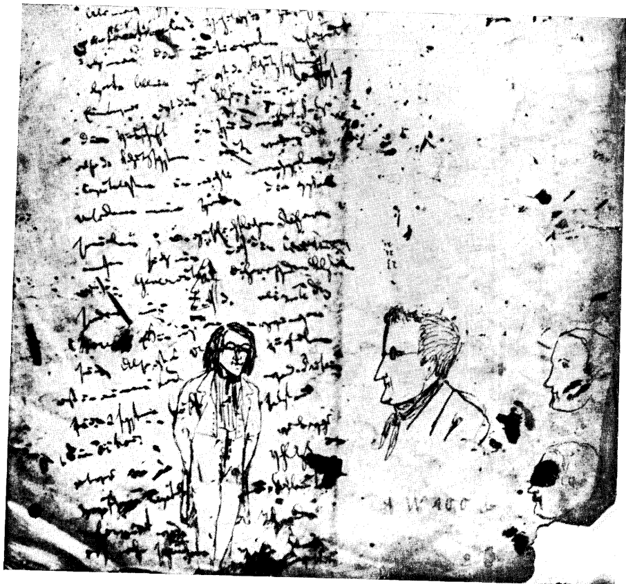
Bottom of the page from Marx's manuscript, "Protectionists", with drawings by Engels