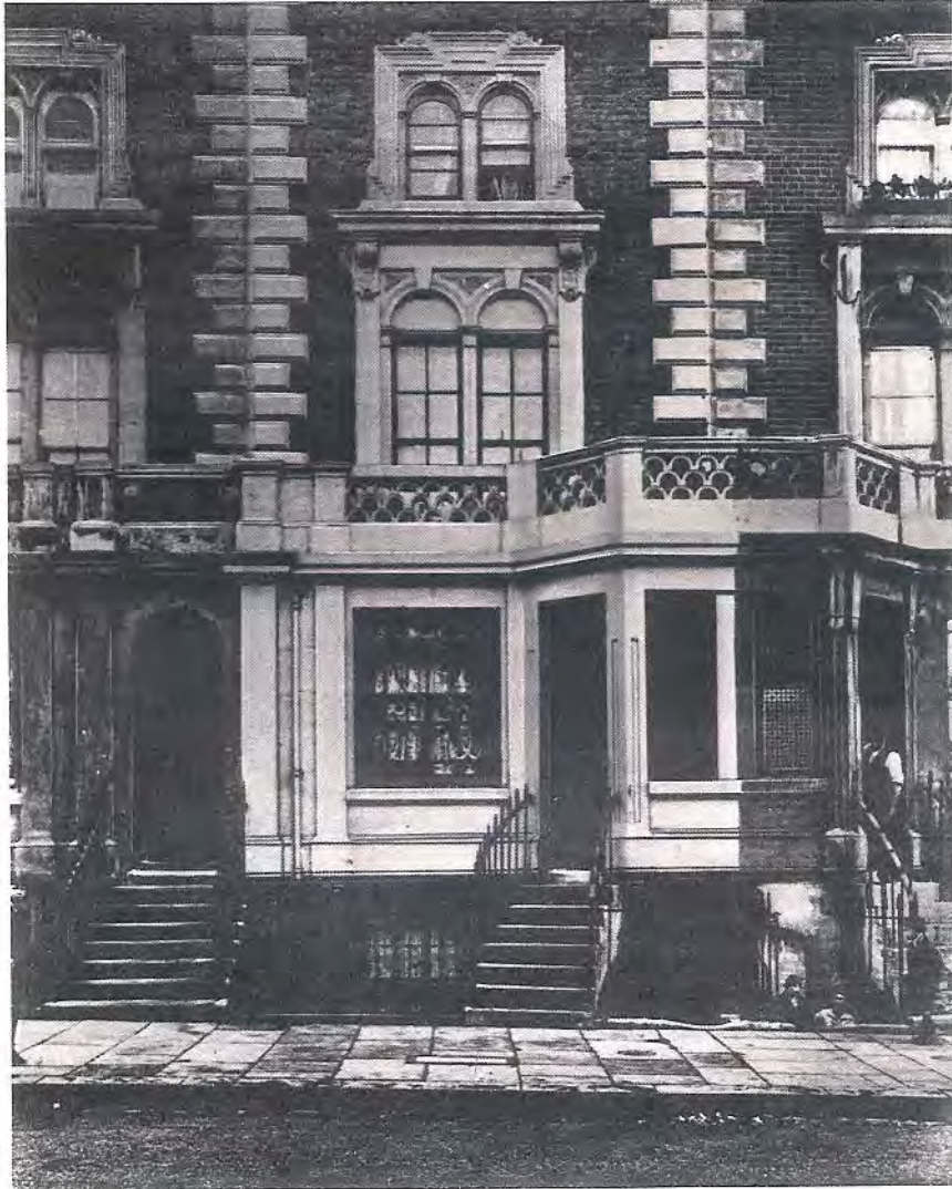
9 Grafton Terrace, Maitland Park, Haverstock Hill, London, where Marx lived from October 1856 to 1868