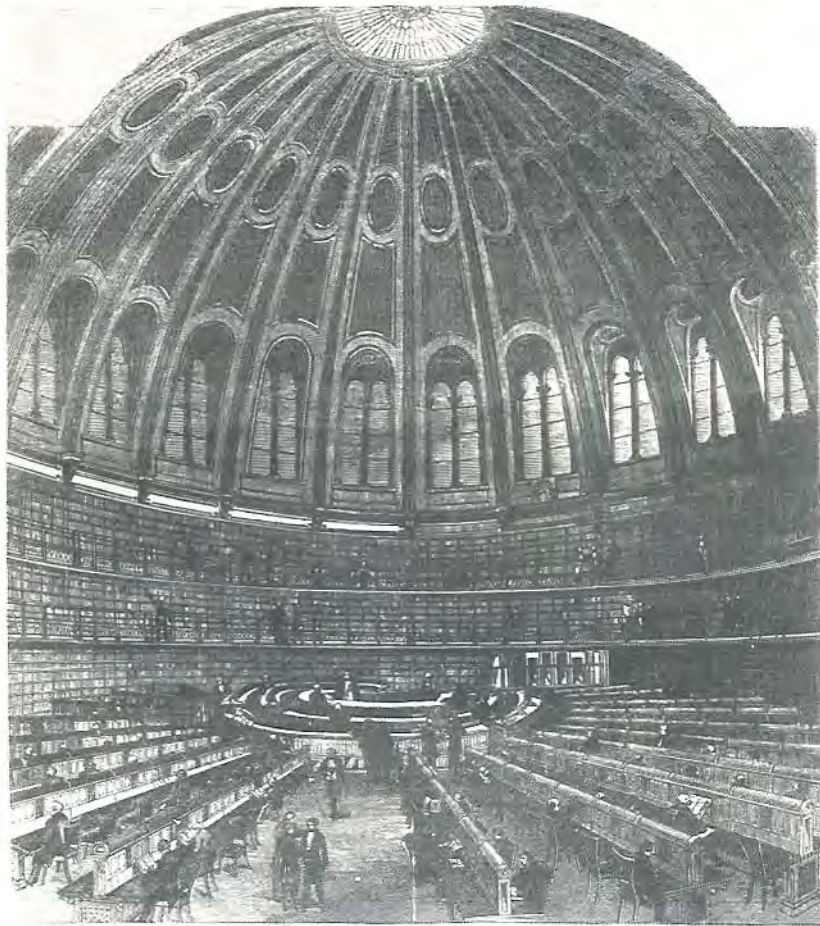
The reading-room of the British Museum, London, where Marx worked