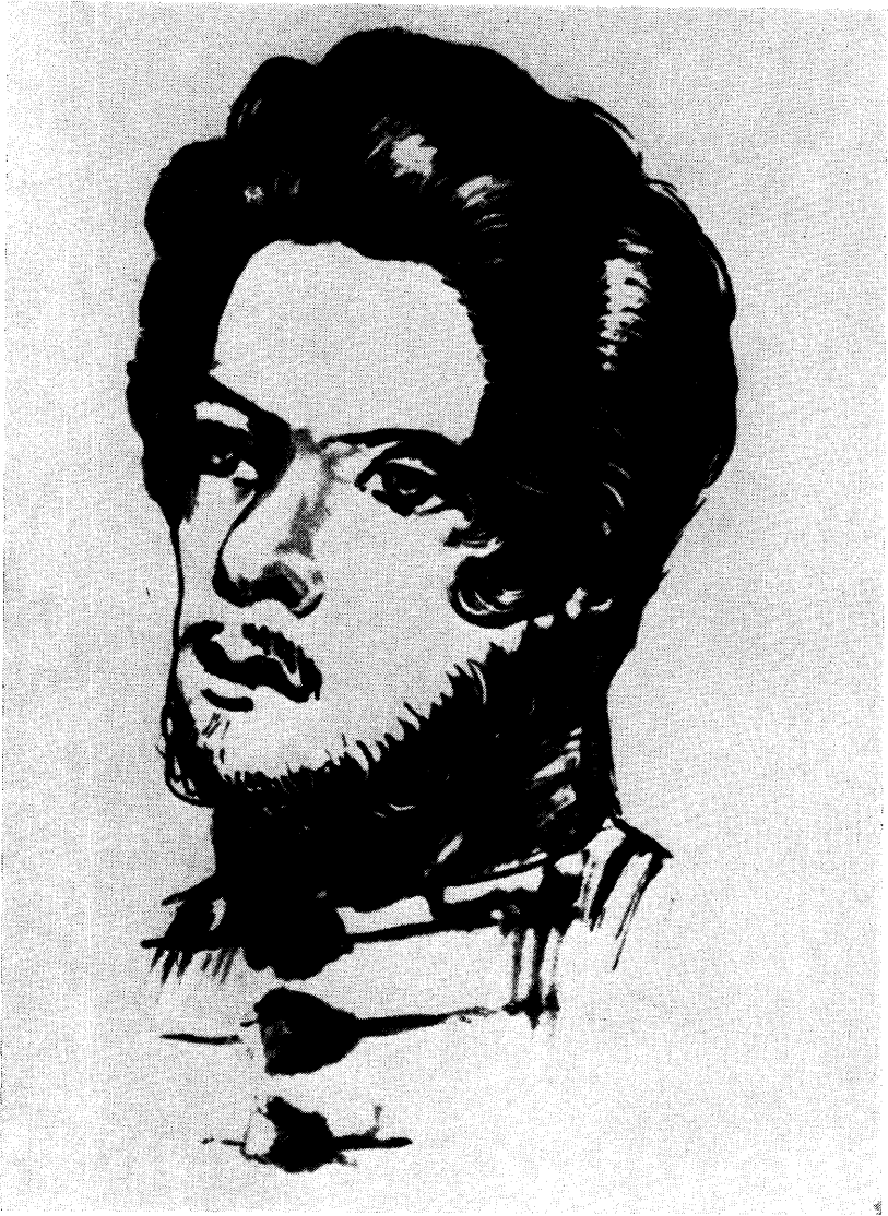
Portrait of Karl Marx in his student years