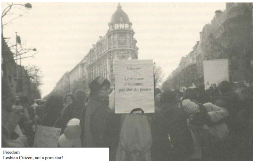
Freedom Lesbian Citizen, not a porn star!