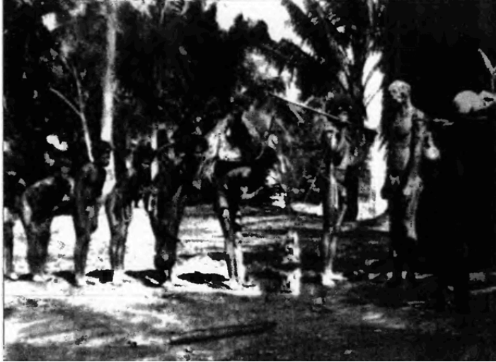
Adam Smith's homo economicus in its natural environment, engaged in financial speculation from the depths of the cave.

a farce all the more amusing considering that no such species has ever existed, even in the London-style “City,” where nonetheless certain cave-dwelling sorcerers called “stock traders” abound.