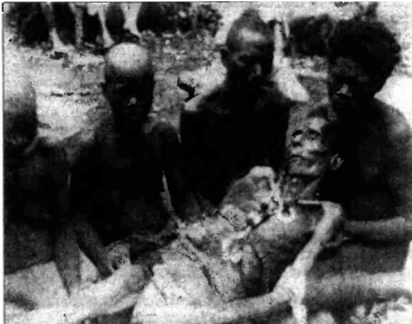
"The Common can however erupt into Publicity, in the form of individual or collective experiences, which are always experiences of the inexpressible. The presence of the Common is none other than the presence of the transcendent."

3) More specifically: the existence of this mystery can be rendered public,