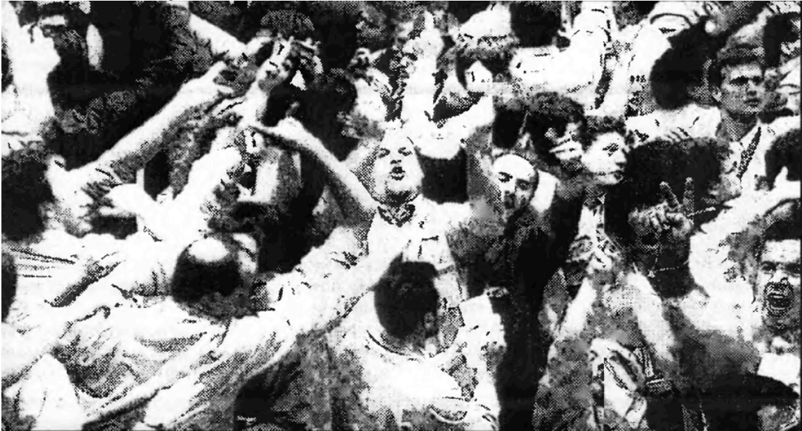
The Frankfurt Stock Exchange