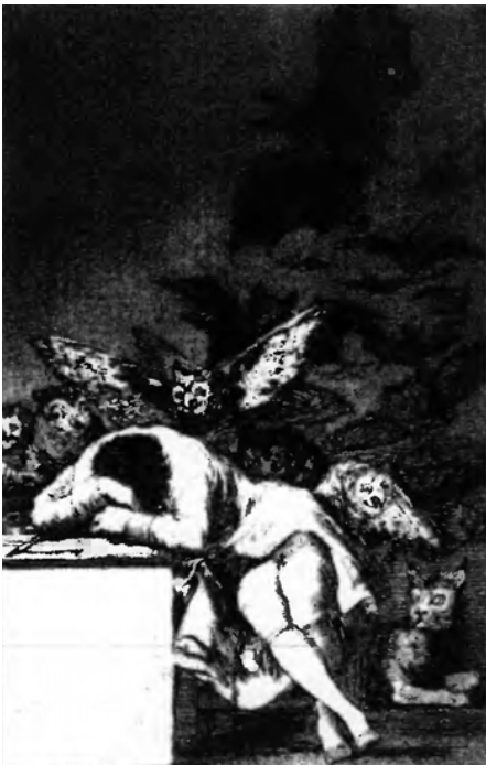
Goya, The Sleep of Reason Produces Monsters . "The spirit of nature is a hidden one, it does not manifest itself in the form of a spirit: it is only a spirit for minds that know it, and it is spirit in itself, but not for itself."

Remark: Bloom often attempts, with the use of apparently particular commodities, and with roles (in the sense of the term used by the Situationists) – roles that not only generally organize themselves around commodities, but are themselves commodities ontologically speaking, as the following section of this article makes clear – to capture a simulacrum of individuality. He sometimes attempts to take on a reassuring pseudo-belonging to some puppetlike community or other, one of those that manage a poor substantiality (we note that this pseudo-belonging has for Bloom the advantage – which becomes even a necessity – of reducing the tyrannical power of the Other, that thief of life, that demiurge, by taking it down to proximity; thus it can be tamed, gotten used to... - and this spiteful relationship between enemies, between strangers, is in general the basis for that abject state still called "friendship"). This is what the disgusting ad-men of the commodity and certain of their sociologist colleagues dare to call a "tribe." But if this abstract form of a species is a tribe, it is clearly but the tribe of roles and of the commodities that organize it, rather than that of the Blooms themselves, who are merely the mediators of the all-important communication that things engage in so as to ever further appropriate the Common, and ever further alienate Publicity.