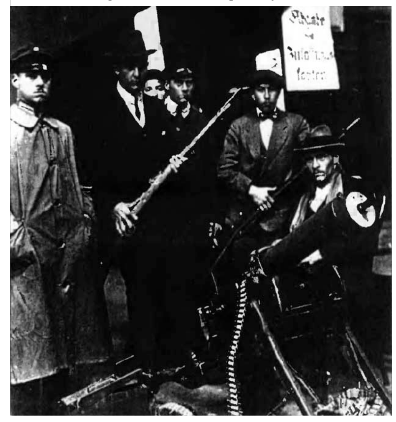
"The soviet is the place of silence" (Brice Parain)

negativity in order to suffocate it, but all that did was free it from mimetic behavior control and make it take to the shadows where free forms of existence can blossom. But the most disturbing aspect of these new people of the abyss – since that's how they were depicted – was that the critique they were carrying out was above all the affirmation of an ethos that is foreign to the Spectacle, that is, a heretical relationship to lived experience. It appeared that in this section of territory it thought it had gotten squared away, there were recesses where relations were not mediated by it; that in other words its monopoly on the production of meaning was not just being contested but had even been locally and temporarily removed. And it's clear that those who – and this is a rare event in these "autonomous zones" – succeed in tying together a critique of commodity society and an